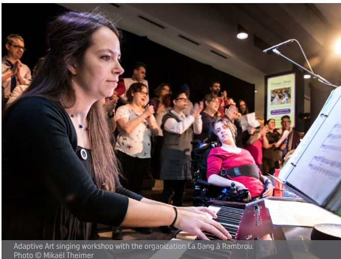
Adaptive Art singing workshop with the organization La Gang à Rambrou.

It also thanks TD Bank Group for its $10,000 contribution to the very first edition of the Indigenous Open Mic event.