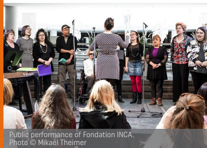
Public performance of Fondation INCA.