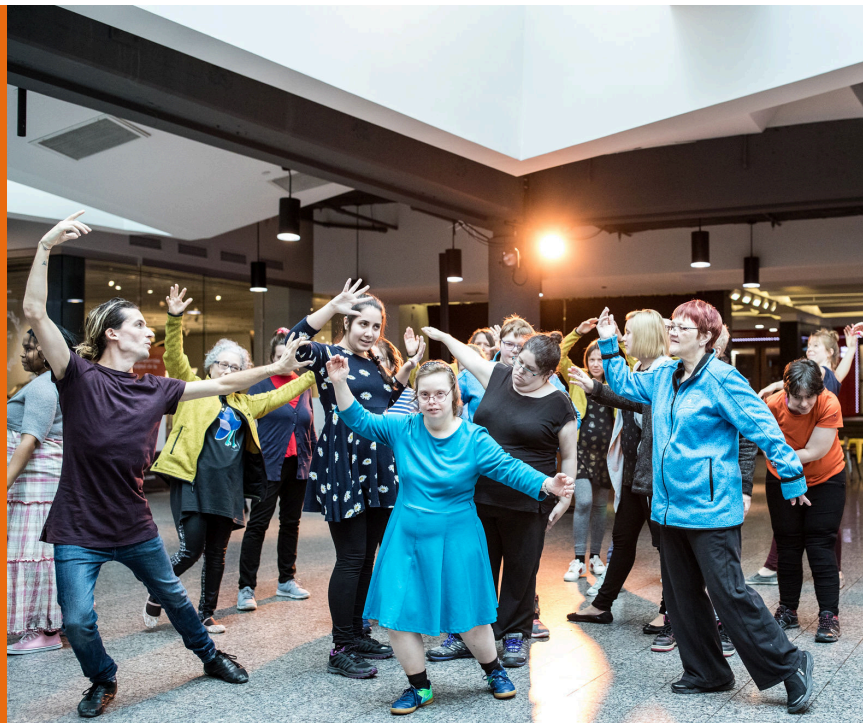
Dance workshop with the organization Atelier le Fil d'Ariane.

14 public performances by the participating groups in Place des Arts' public spaces