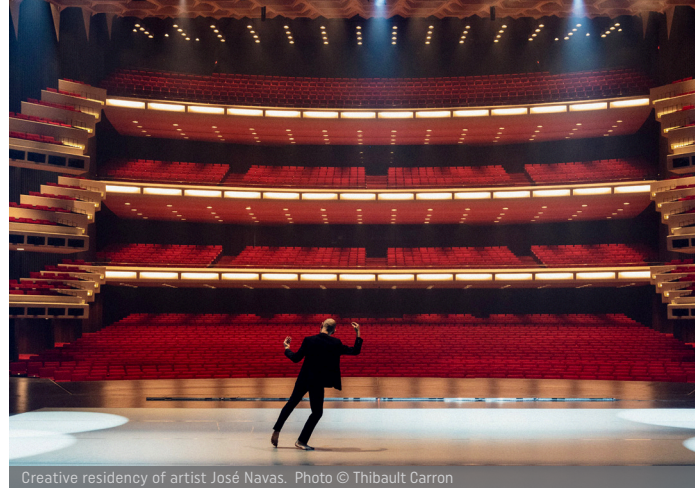
Creative residency of artist José Navas.