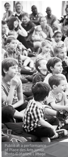
Public at a performance of Place des Arts junior.

437 spectators at the performances of Place des Arts Junior, giving children an introduction to the performing arts alongside their families