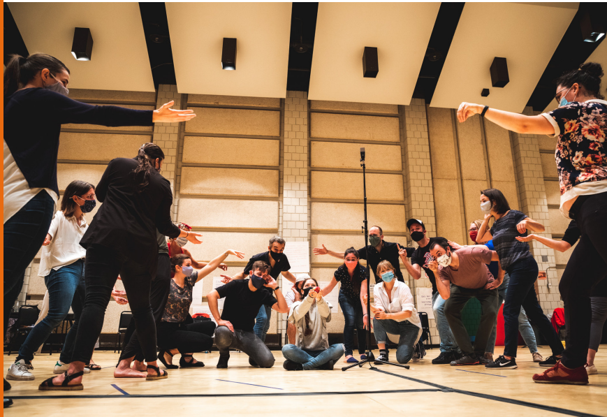
Training in aesthetic education.

Two days of training for teachers seeking to lead their groups in this pairing of culture and education