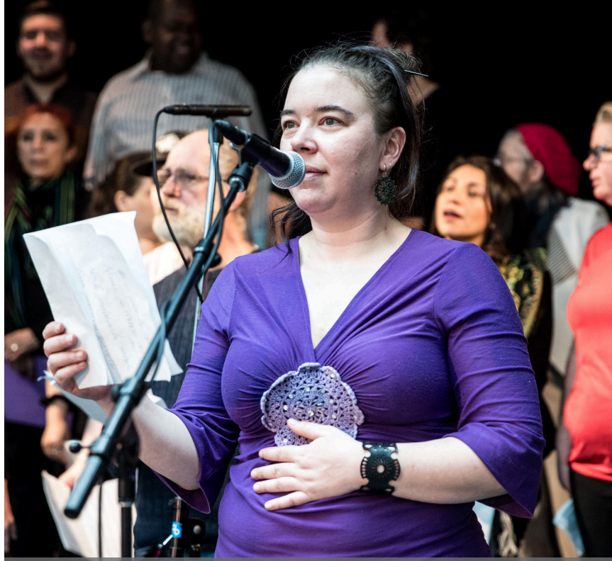
Public performance of the organization Sans oublier le sourire.