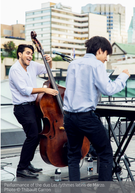
Performance of the duo Les rythmes latins de Marzo.