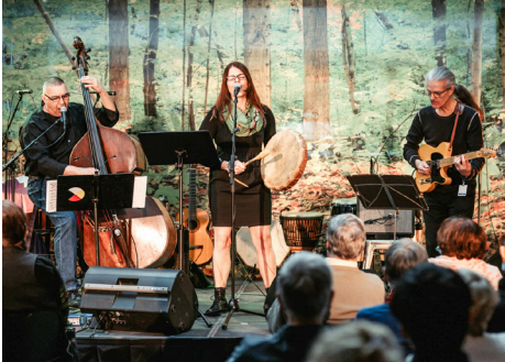
Kawandak Quartet performance at Indigenous Open Mic.