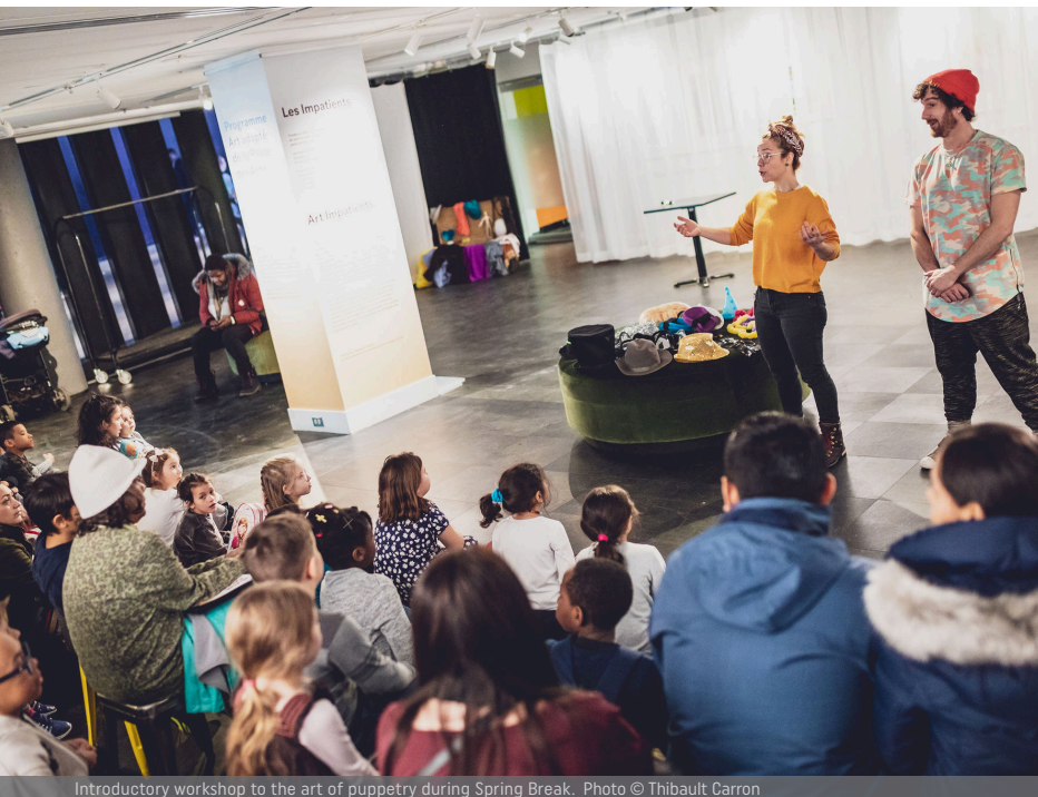
Introductory workshop to the art of puppetry during Spring Break.