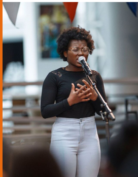
Performance of a student during the Slam Marathon.