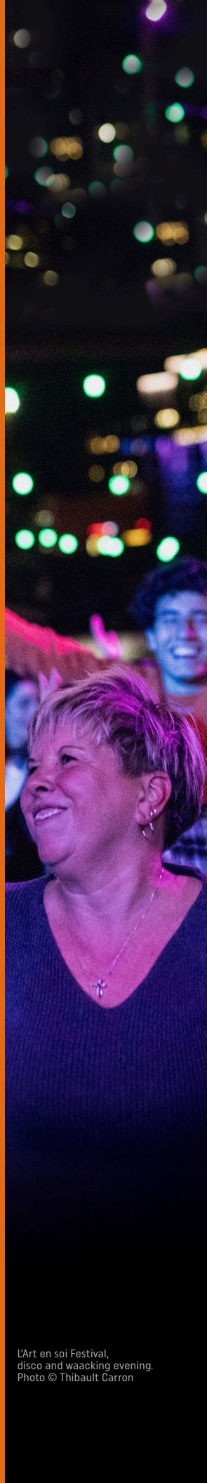
L'Art en soi Festival, disco and waacking evening.

to accessibility to the arts and culture for tens of thousands of people of all backgrounds—including families, students, and members of various communities