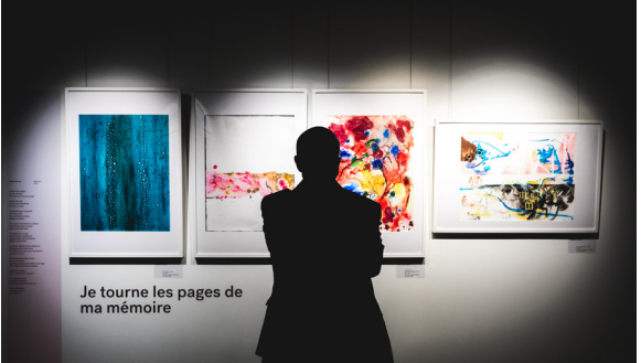
Exhibition "Ce paysage qui te ressemble", resulting of a multidisciplinary project with the organization Les Impatients.