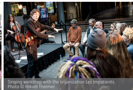
Singing workshop with the organization Les Impatients.