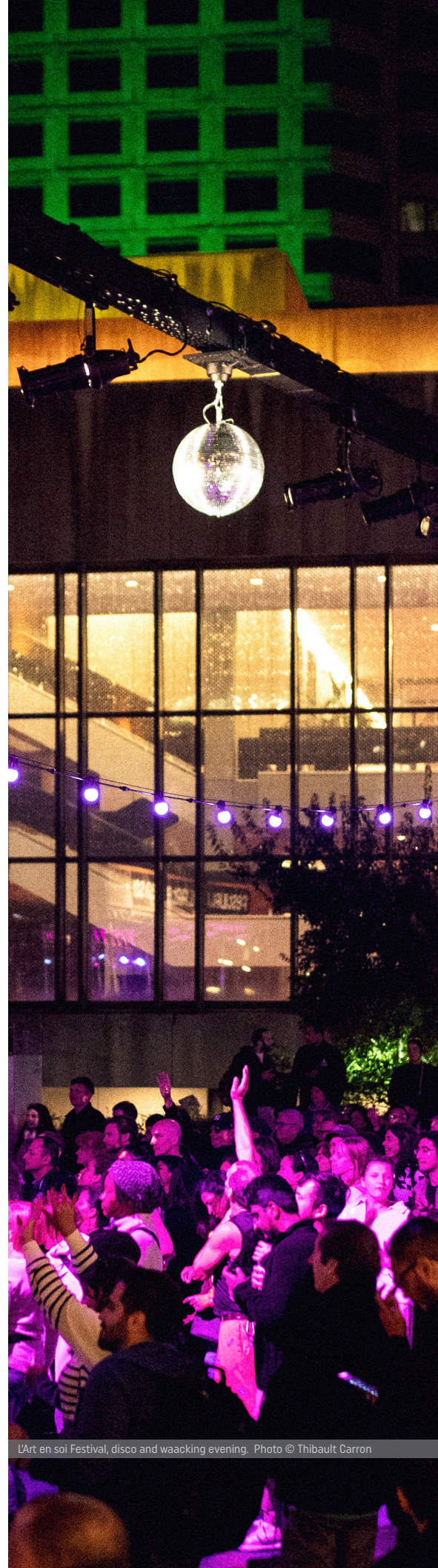
L'Art en soi Festival, disco and waacking evening.